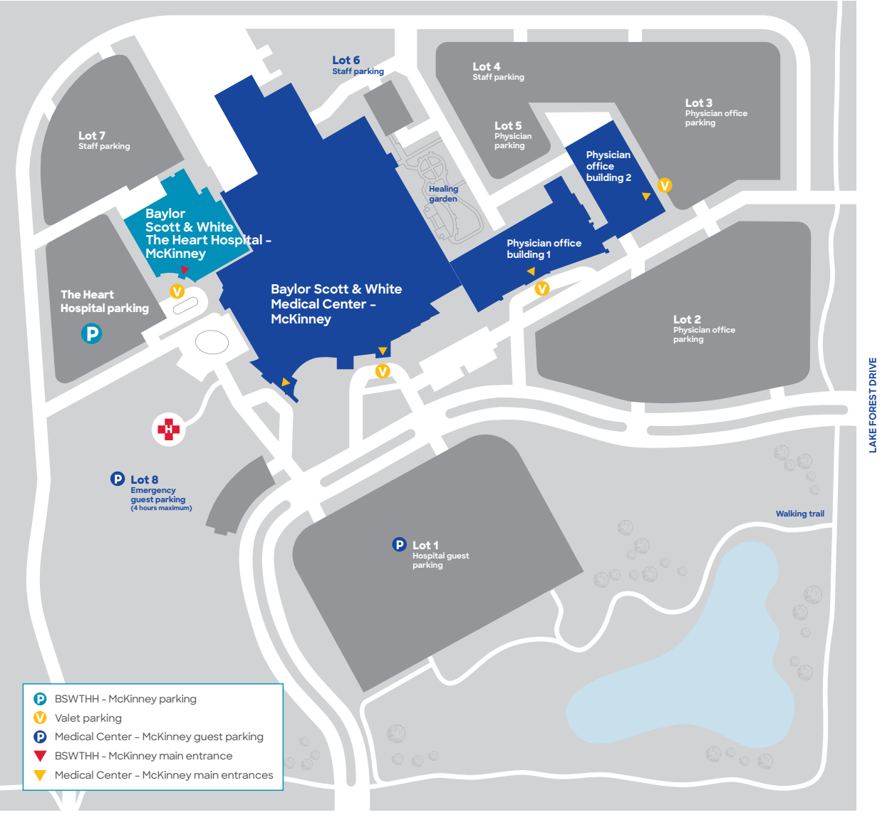
UNIVERSITY DRIVE / US HIGHWAY 380